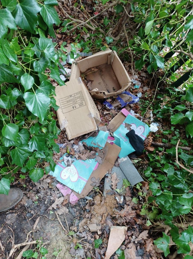
Fly tipping and litter has been our main priority over this last month