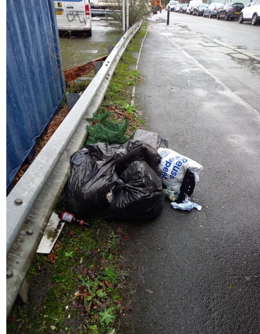
We have accumulated 1,860KG of litter and fly tipping combined in January